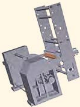
TURRET & SPLICING WITH INFEED UNIT (Used in rotogravure & coating machines)