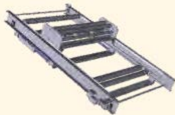
SPLICING WITH BUTT TECHNOLOGY FOR HIGHER GSM (Used in corrugations and cigarette paper industry)