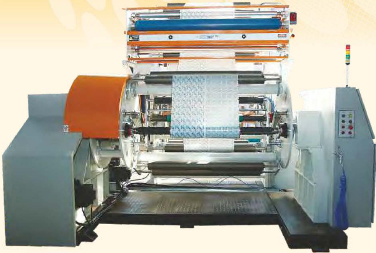
TURRET WITH INTEGRATED SPLICING (Used in converting/offset industry)